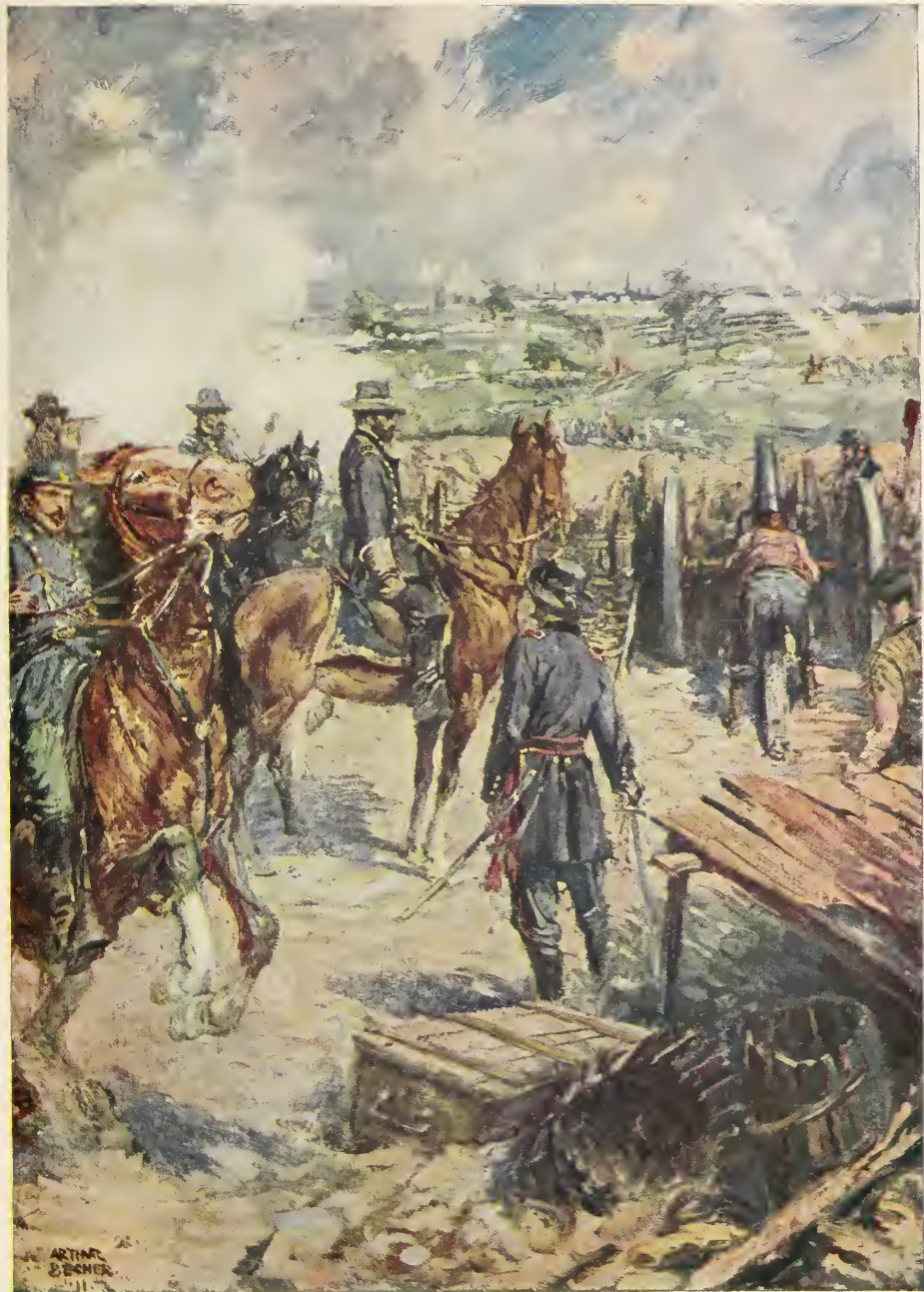
GRANT AT THE ENTRENCHMENTS BEFORE PETERSBURG.